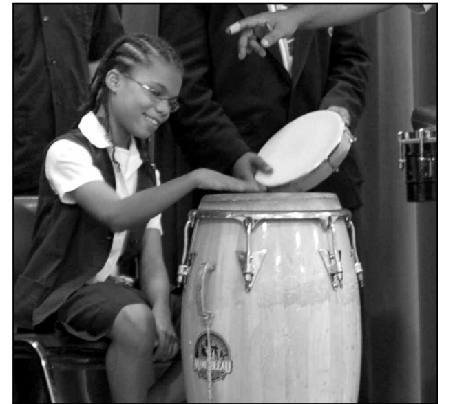
A student gains hands-on experience on the conga.

These collaborations combined with the Teaching Artist Concert Series resulted in 40 visiting concerts reaching our more than 8,000 partner school students. In all cases, ETM works together with each principal to select the most educationally-appropriate concerts for each school, so that children can benefit from quality enrichment opportunities that have relevance to what they learn on a weekly basis in the music classroom.