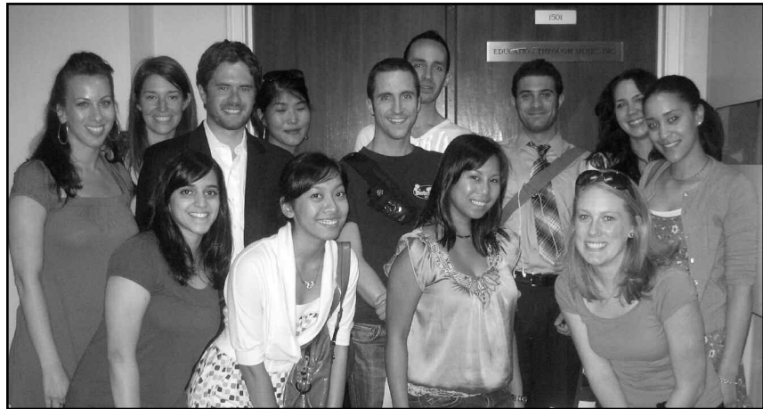
A group of ETM Associates met in August to gear up for the new year.

The ETM Associates continued to grow in number and raised over $20,000 through events and contacts to help support ETM's partnership with PS 155 in East Harlem this past year. We thank the Associates and the Steering Committee for volunteering their time, energy and talents to help promote ETM's programs.