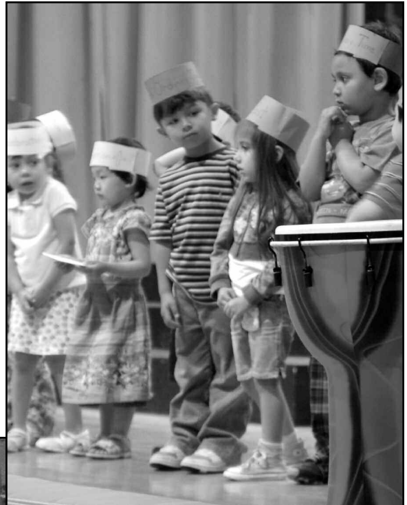
Above: Students from St. Clare School await their chance to perform.