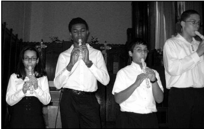
Above: St. Athanasius School students perform on recorders.