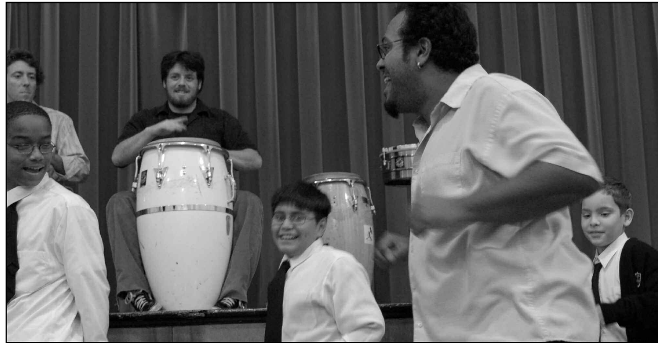
Performers from the Caribbean Rhythms concert interact with students at St. Ann School in East Harlem.

ETM expanded a series of educational concerts designed by ETM teaching artists and offered four different concert programs to our partner schools this past year. Fourteen schools took advantage of this opportunity to provide additional live performances to the students, and scheduled a total of 23 concerts.