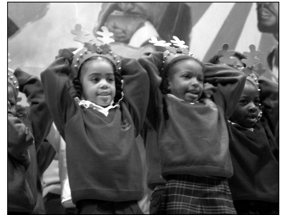
St. Mark the Evangelist School's students are clearly excited to be performing in Harlem.