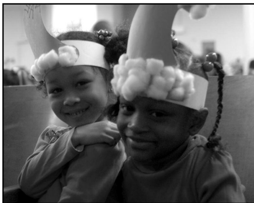
Students at PS 38 eagerly await their performance. For more concert photos, see pages 4-5.

I wanted to expand beyond the typical repertoire while remaining appropriate to the spirit of the season. With the ground-breaking election of Barack Obama on everyone's minds, I decided to include a few politically-oriented songs and titled our presentation Winter Concert: A Season of Change . As we had done a unit on rock 'n' roll in the fall, I included two Beatles songs and one Bob Dylan song. And so as not to miss out on the holiday spirit, we threw in Blue Christmas , as performed by Elvis Presley, and the hip-hop classic Christmas in Hollis by Run-DMC. I incorporated more instruments into